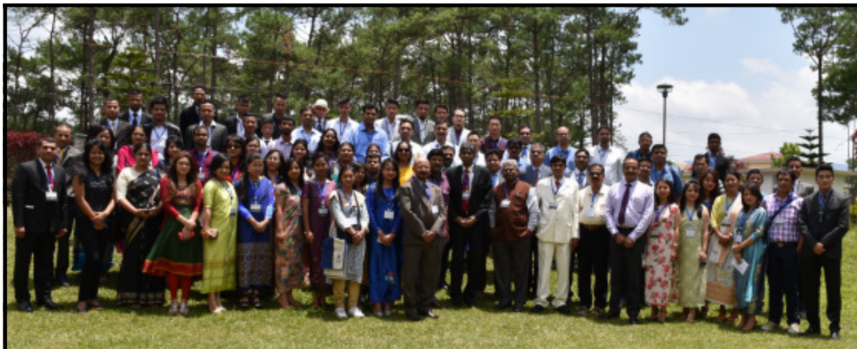
Delegates, staff and participants pose for a group photo.

T he International Conference on Advancement in Tourism in Hospitality Marketing (ATH-MCON-2016) was held on May 17th and 18th at the New Guest House, NEHU, Shillong. The two day event was organised by the Department of Tourism and Hotel Management, NEHU, Shillong with the support of Indian Council of Social Science Research North Eastern Regional Centre (ICS-SR-NERC) and the Meghalaya Go-operative Apex Bank Ltd.