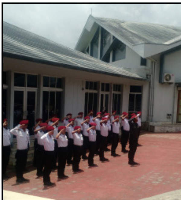
Security personnel salute the flag.

HUSU) congratulated the University for attaining 43 years. Though there have been ups and downs, the NEHUNSU representative hoped that the University continues to provide the students with better facilities so that they can excel in their different fields.