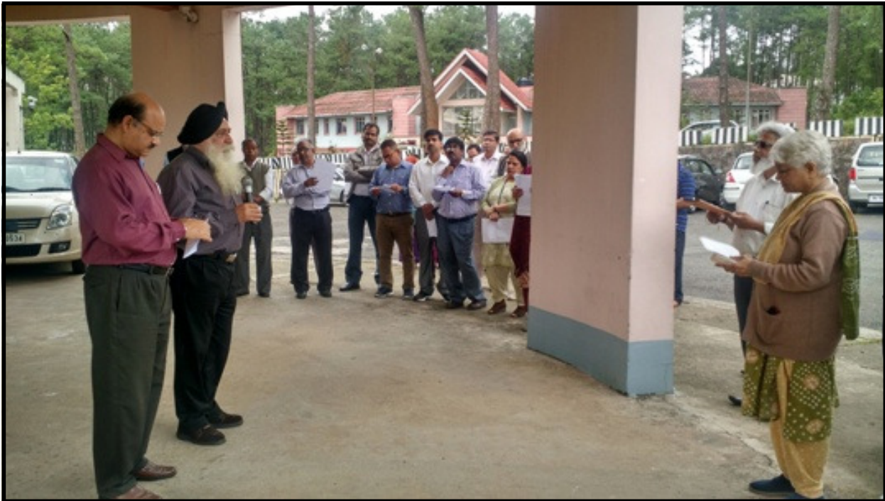
NEHU staff, teachers and students read out the pledge in front of VC's office.

N EHU observed Anti-Terrorism Day with the reading of the pledge by NEHU authorities, teachers, students and staff, in front