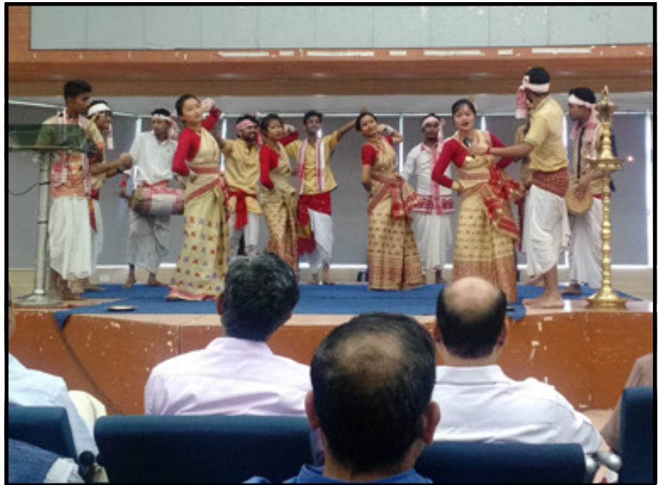
Students perform Bihu dance at the University Day function.