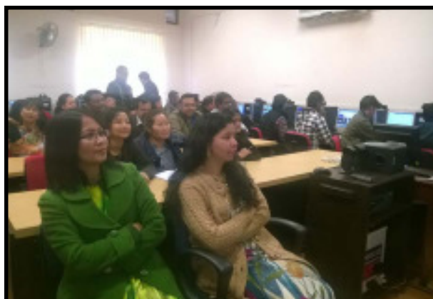
Participants attend one of the discussions.

A three-week Special Winter School on the theme “Challenges in Higher Education and the role of ICT (Information Communication Technology)”, organised by the UGC-Human Resource Development Centre (HRDC), NEHU, Shillong, concluded on November 14.