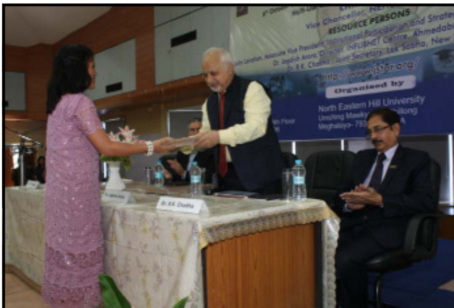
One of the resource persons being feted at the inaugural function.

J STOR India User's Forum 2015, a joint effort of JSTOR (New York) and INFLIBNET Centre (Gandhinagar) and coordinated by the NEHU Central Library, was hosted by NEHU on October 6th at the Multi-Use Convention Hall.