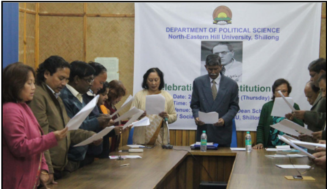
A reading of the Preamble of the Constitution.

To mark the 66th year of the adoption of the Indian Constitution by the Constitutional Assembly, the Department of Political Science, NEHU celebrated the Constitution Day on November 26 at the Dean's Conference Hall.