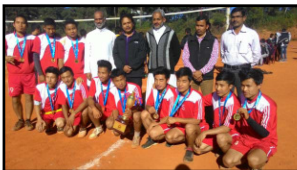
The winning team pose with NEHU staff and college officials.

In the men's section, St. Anthony's College beat Union Christian College, Umiam while in the women's