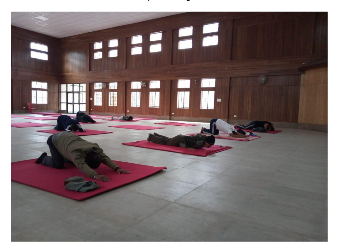
Surya Namaskar Session in progress.

Despite winter vacation and severe cold weather there was enthusiastic participation in Surya Namaskar program from various sections of the University consisting of students, teachers and non-teachers.