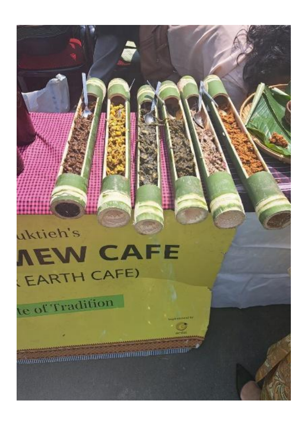
Stalls selling local indigenous vegetables