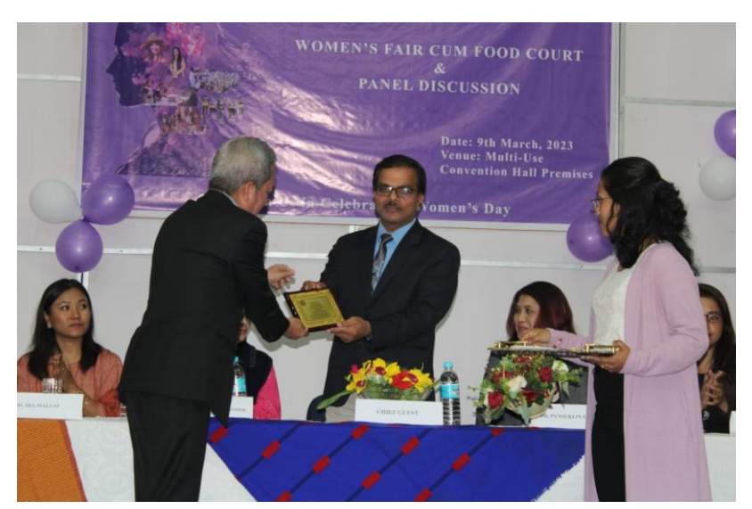
Felicitation of the Vice Chancellor