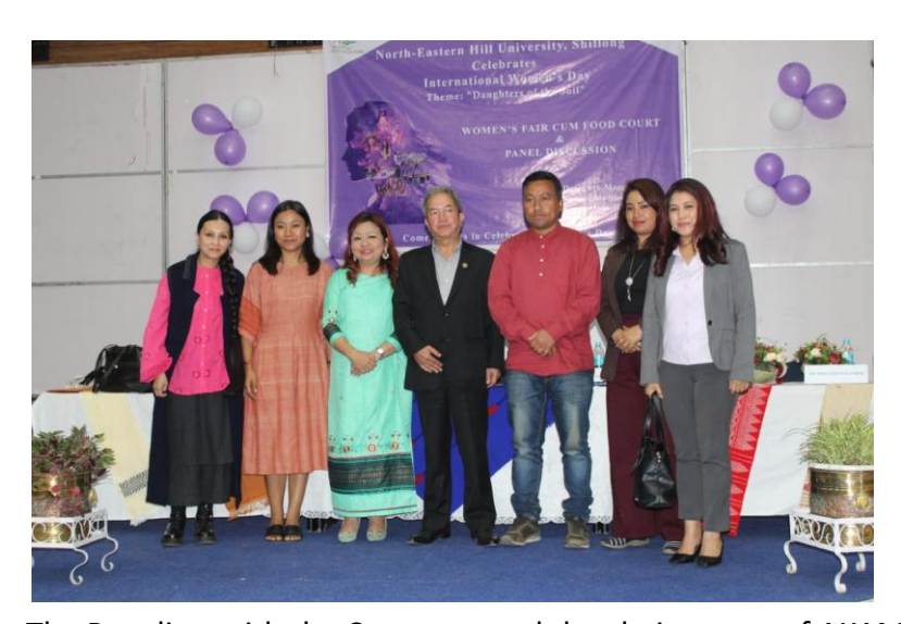
The Panelists with the Convenor and the chairperson of AKAM \,