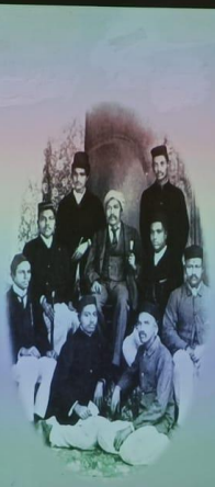
At Baroda College with his students