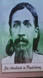
Sri Aurobindo in Pondicherry