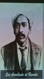
Sri Aurobindo at Baroda