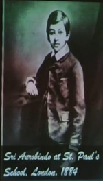
Sri Aurobindo at St. Paul's School, London, 1884