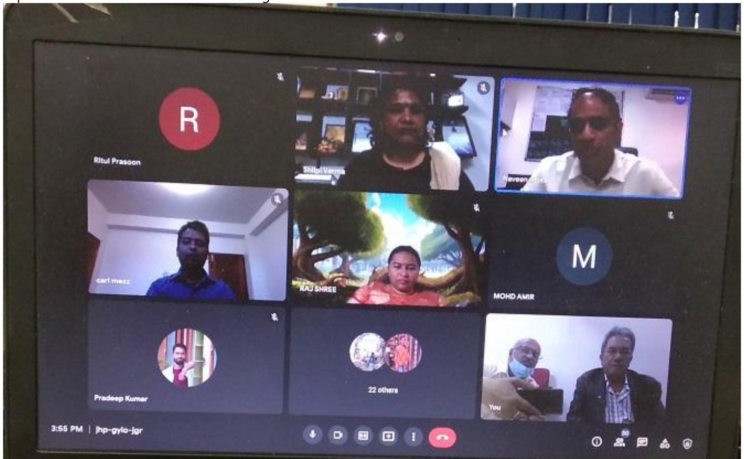
Figure 3 Participants in the Online Cultural Exchange Program on Tourist Places of Shillong and Lucknow

The presentations made by the BBA ,Lucknow team was a stimulating showcasing of the monuments, structures and temple culture found in various places and sites in Uttar Pradesh. The additional highlight was the vignettes of the cultural and culinary aspect of Lucknow. The NEHU team dwelt largely on the tourist spots located in and around Shillong and the camera work, done by drone technique, provided a virtual excursion of the hill city to the audience. The programme was greatly appreciated by the audience and the organizers agree that both the institutions would explore more avenues for cultural exchange between the two institutions.