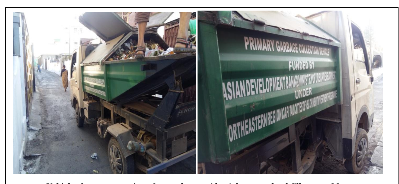
Vehicles for transportation of waste from residential areas to land-fill area at Marten