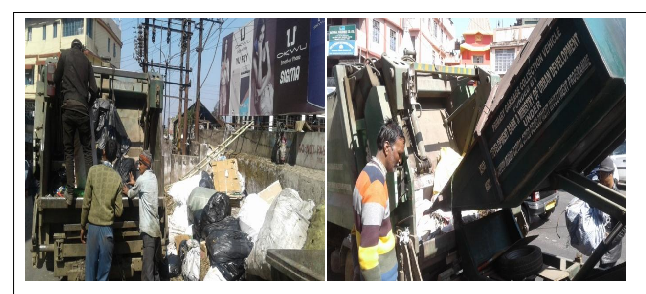
Staff of SMB collecting wastes from commercial areas of the city