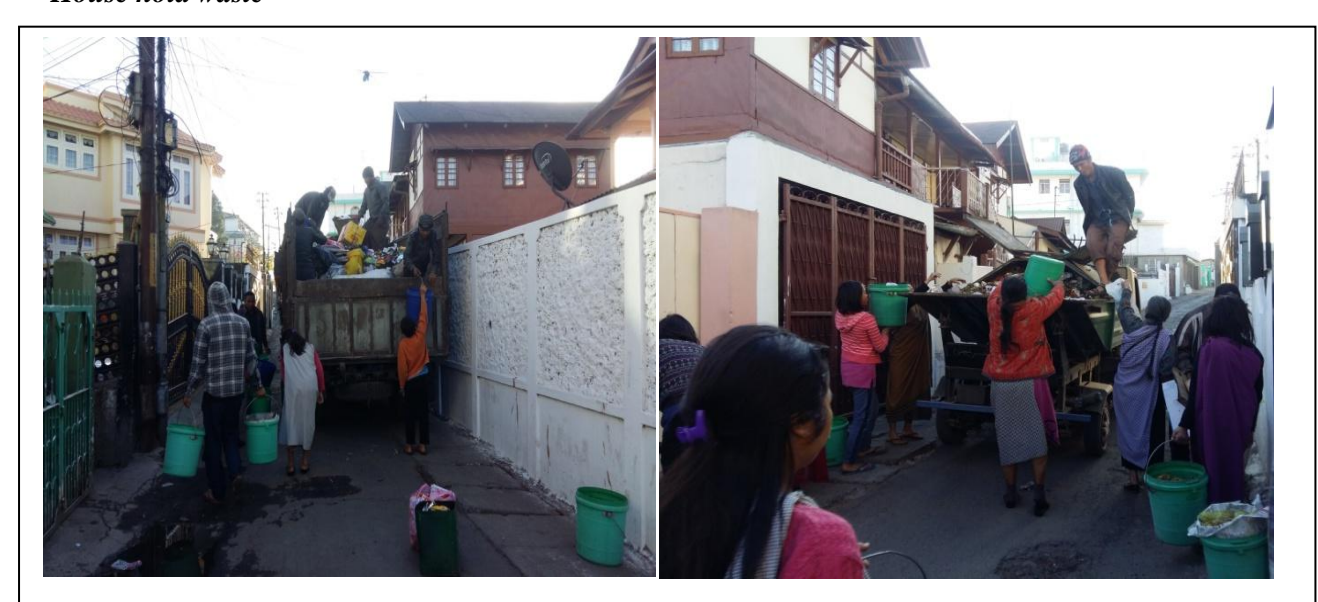
Collecting of house hold waste at residential area in the city