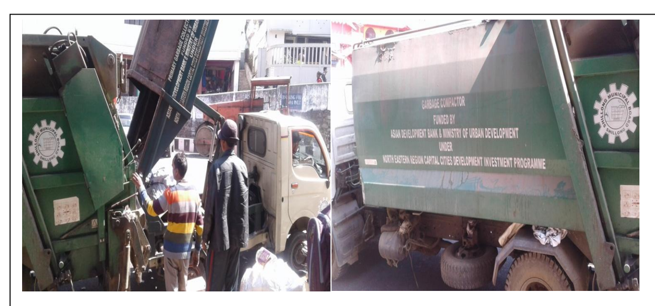
Vehicles for transportation of waste from commercial areas to land-fill area at Marten