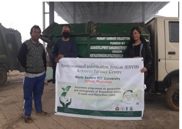
ENVIS Team at Land fill, Marten, Mawiong