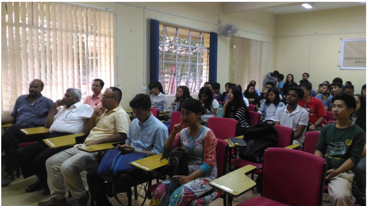
Professors, Teachers and students from different department attending the Programme