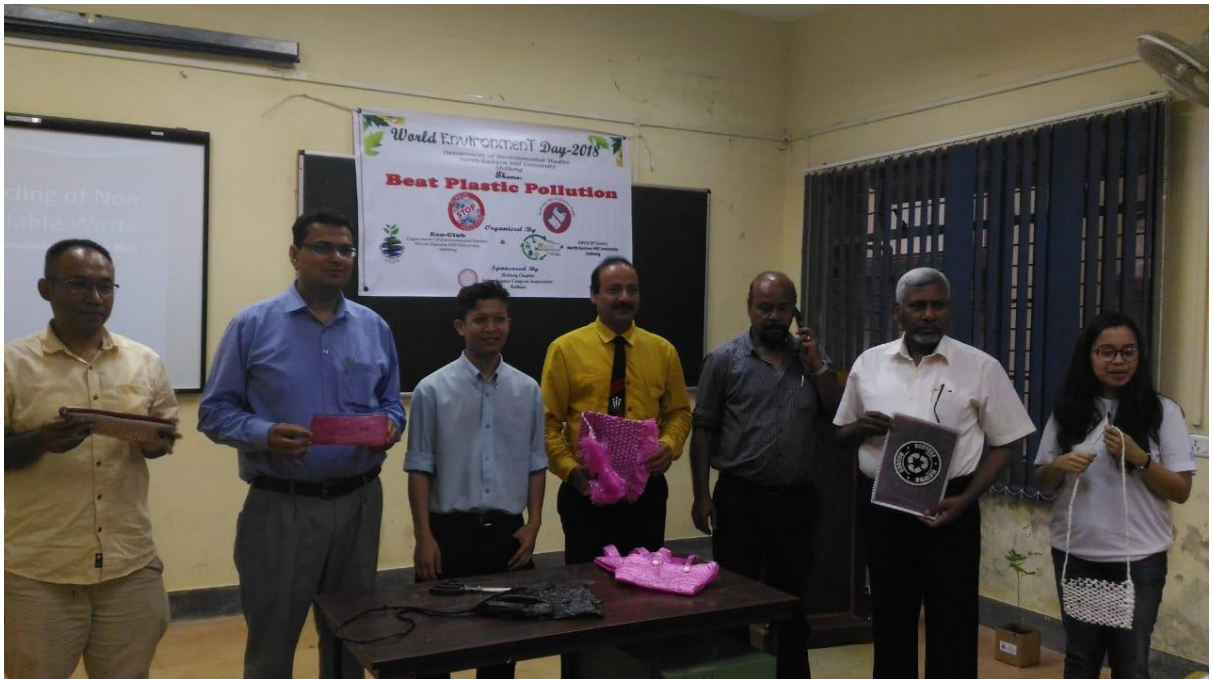
Highlights of the Creative day to day items made by using Plastic waste. (From left to right) Pencil pouch, table mat, ladies hand bags, file cover, ladies carry bag.