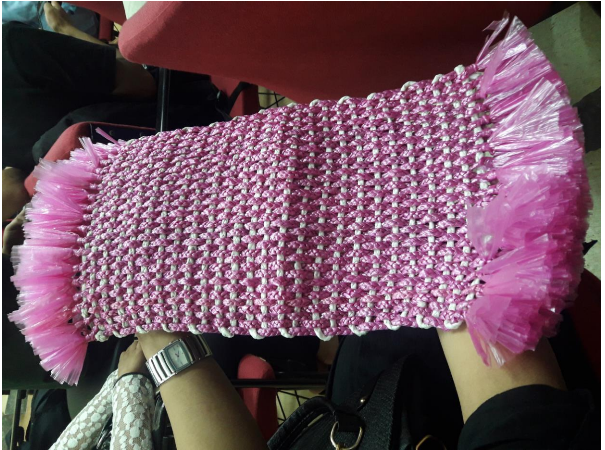
Table Mat made from waste plastic bags.