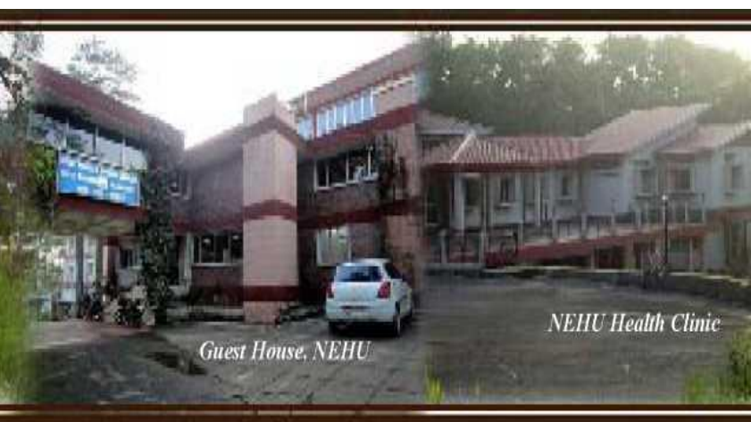
Guest House, NEHU NEHU Health Clinic