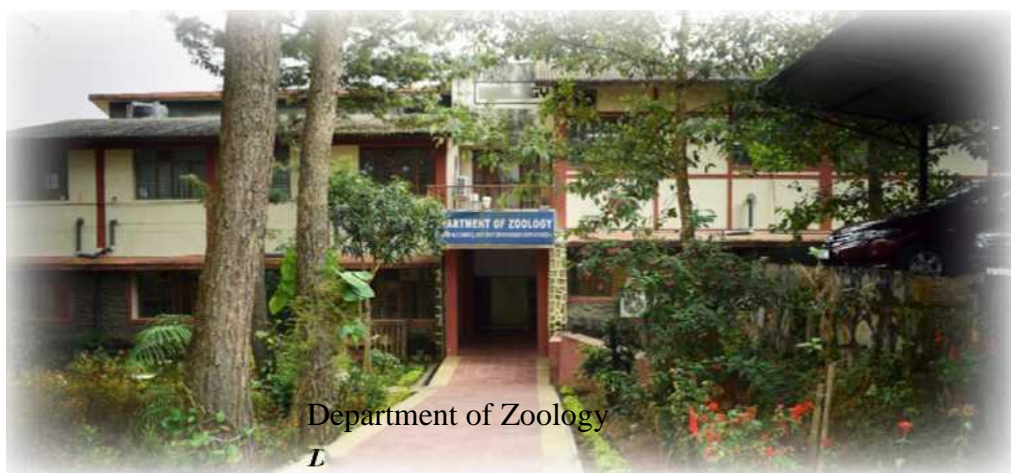
Department of Zoology L

Last date for Registration: February 10, 2020