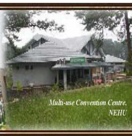
Multi-use Convention Centre, NEHU