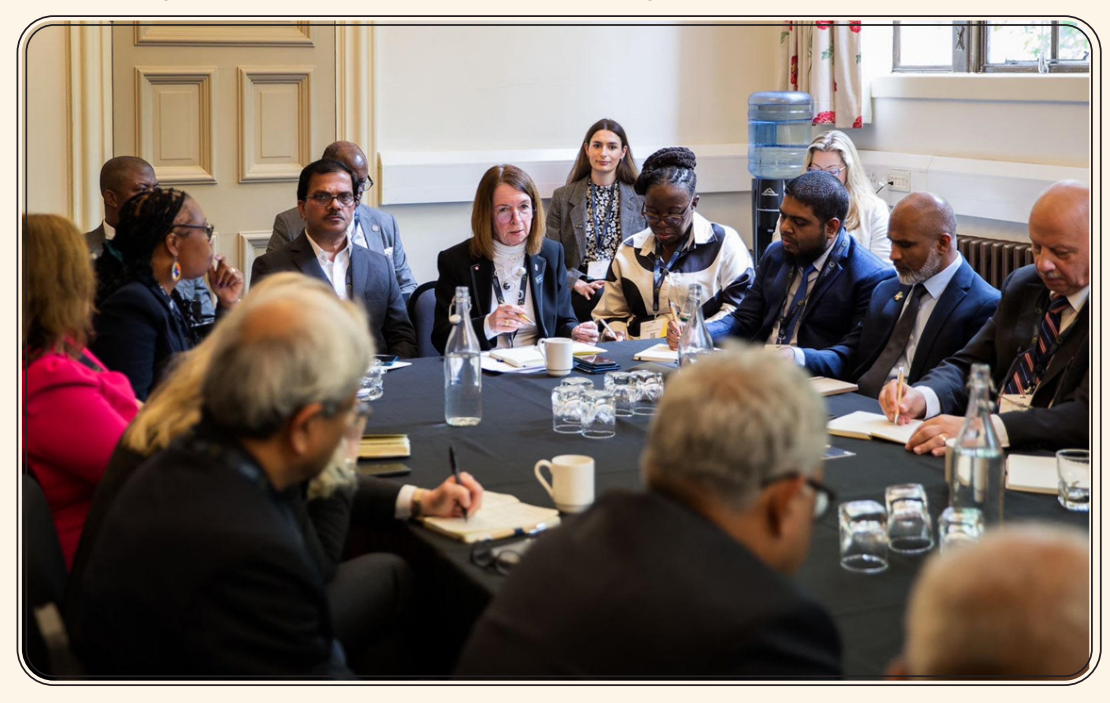
Question 4: Can you please elaborate on your address on Al and Cultural heritage given during the summit in London? Is there any plan to integrate Al into the education system at NEHU?

stone of our strategic initiatives in the next three years. We plan to develop and establish joint research projects and academic programs and to promote faculty and student exchange programs to share teaching methodologies and research findings and promote cultural understanding that would benefit NEHU.