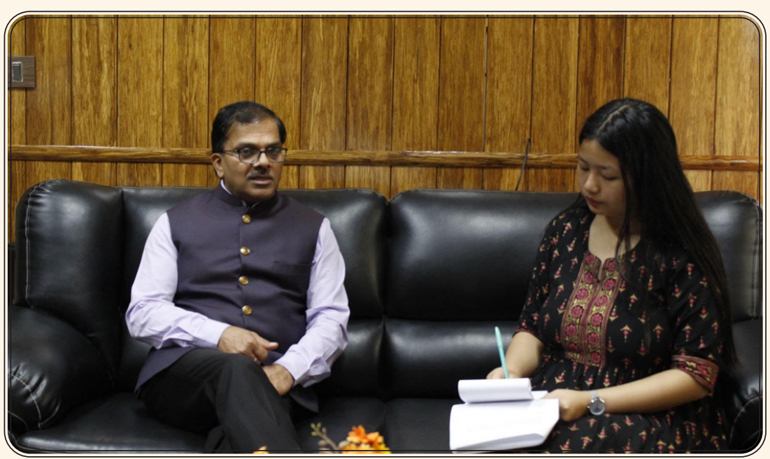
Question 5: What is the takeaway of the summit for Indian universities and NEHU, Shillong from the summit? Answer 5: The summit provided valuable insights and perspectives crucial for NEHU and other Indian universities. It includes a deeper understanding of global higher education trends and best practices, which can inform policy development and enhance academic programs.

Answer 4: In my speech, I highlighted AI's potential to preserve cultural heritage. AI technologies like speech recognition can transcribe and interpret recordings of endangered Indigenous languages and aid their revival. I also discussed unique geographical products like Muga silk, Turmeric, Khasi Mandarin, Tree Tomato, and Naga Chilli, which are grown in Northeast India. At NEHU, we plan to gradually incorporate AI into our education system, focusing on educational apps and e-dictionaries to improve learning experiences while maintaining ethical standards, particularly for translation into local and regional languages.