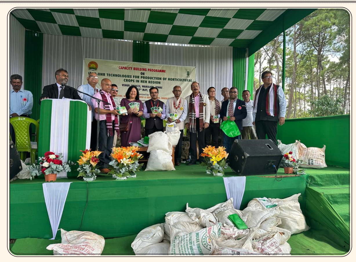
Date: 25th May, 2024: The Department of Horticulture, North Eastern Hill University (NEHU), Tura, in collaboration with the NEHU-Deen Dayal Upadhyay Community College for Skill Development (DDUCCSD), Wahiajer, Jowai, and the ICAR-Indian Institute of Horticultural Research (IIHR), Bengaluru, organized a "Capacity Building Programme on ICAR-IIHR Technologies for the Production of Horticultural Crops in NEH Region" on May 25, 2024, at DDUCCSD, Wahiajer, Jowai. The programme saw the participation of approximately 200 farmers, predominantly women, who each received 50 kg of horticultural inputs.