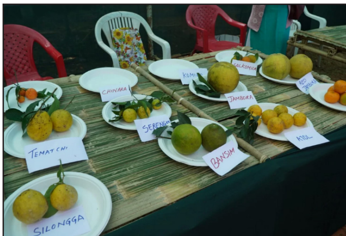
Display of Citrus Germplasm.