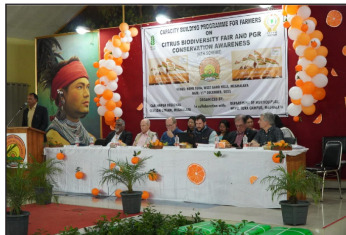
Technical session by NBPGR and International Scientist.