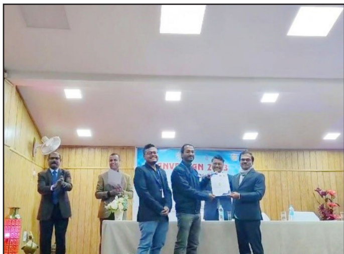
(a) Award receiving moment “Anveshan 2023-24”