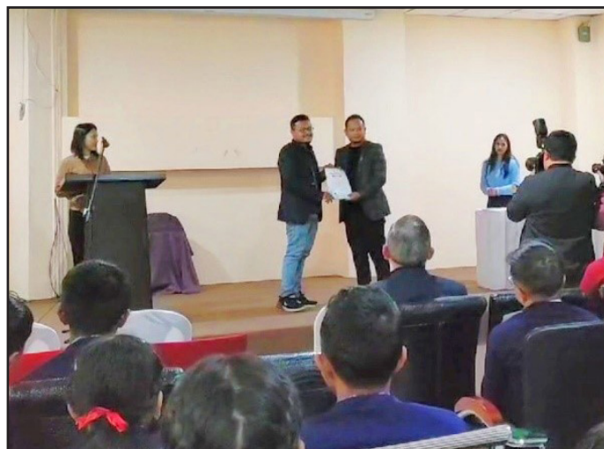
(b) Award receiving moment “NSD 2024”