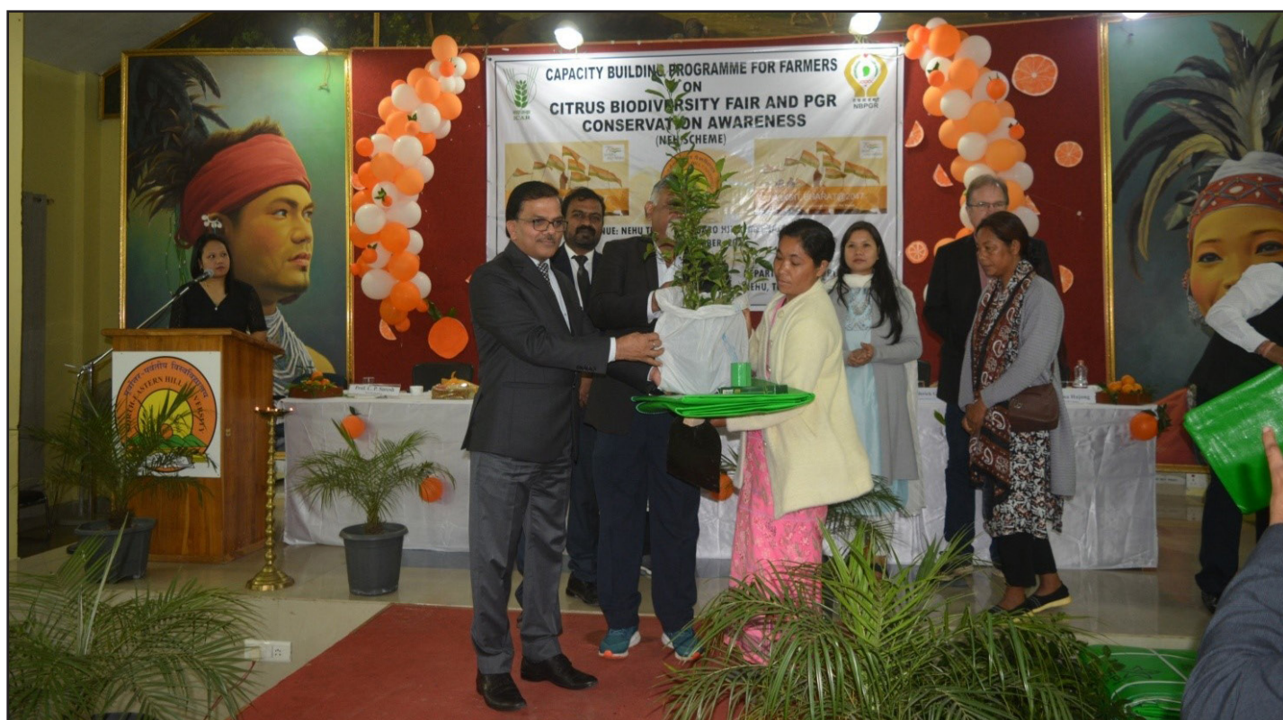
Inputs Distribution to the Citrus Farmers by Honorable Vice Chancellor, NEHU.