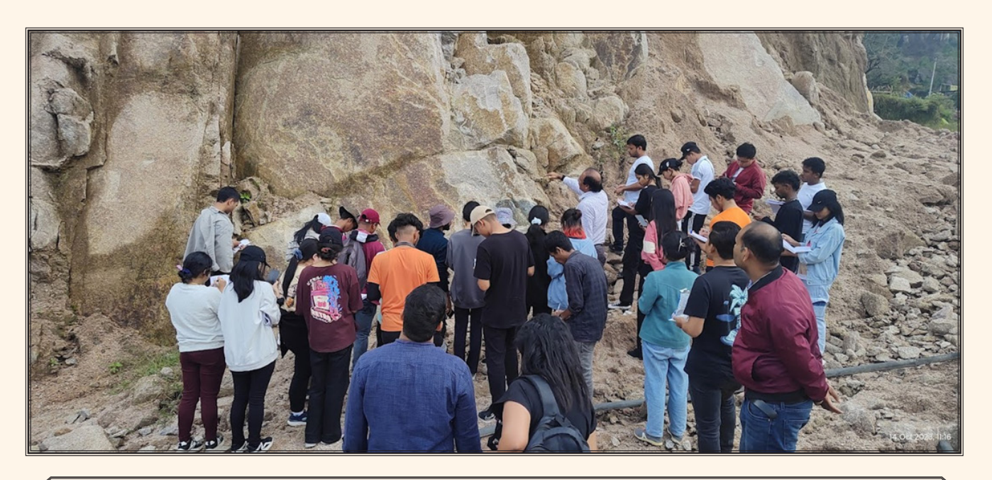
Spot-2: Pink granite batholithic body composed of round-shaped Mafic Enclaves.

Spot- III (N25°27.172' & E91°49.393'): Located South-West of the Mylliem Granite portion and represents the highly metamorphosed contact zone with the presence of andalusite and other associated mineral assemblages. Andalusite and Tourmaline minerals are seen in the