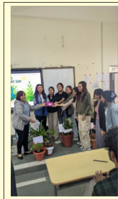
3rdPlace: Group 5 MA 2nd Semester