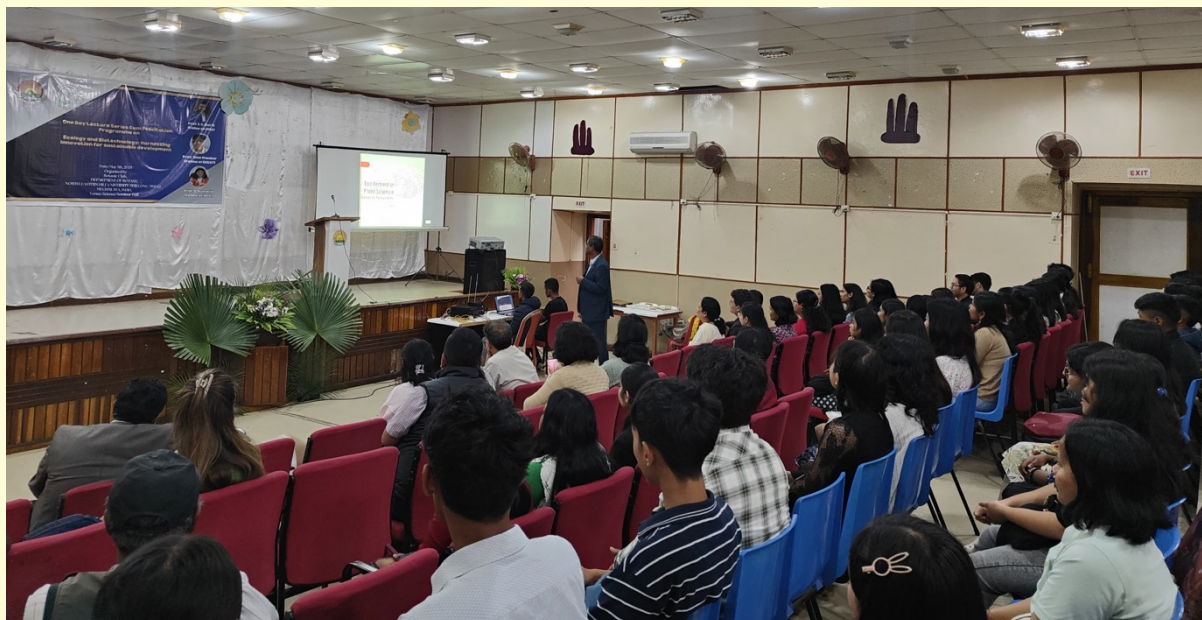
Attendees from different colleges from the city as well as the students and research scholars of Department of Botany, NEHU