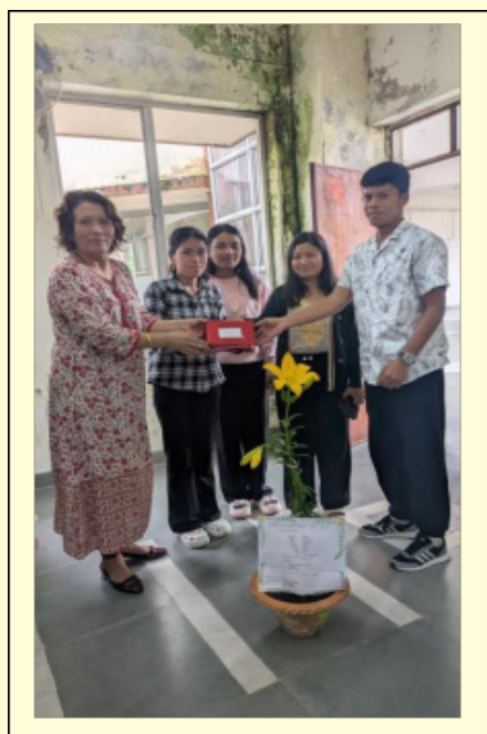
1st Place: B.Sc.B.Ed(ITEP)

Result: 1st place in the potted plant was won by ITEP, B.Sc.B.Ed (group 1), followed by the 2nd place which was won by M.Ed 2nd Semester (group 2) and the 3rd place was won by MA 2nd Semester (group 5)