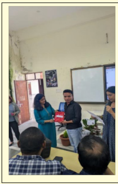
2nd Place:MEd 2nd Semester