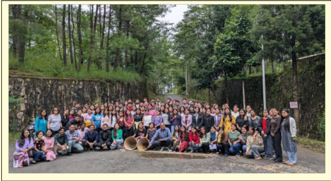
Conclusion of the cleaning drive