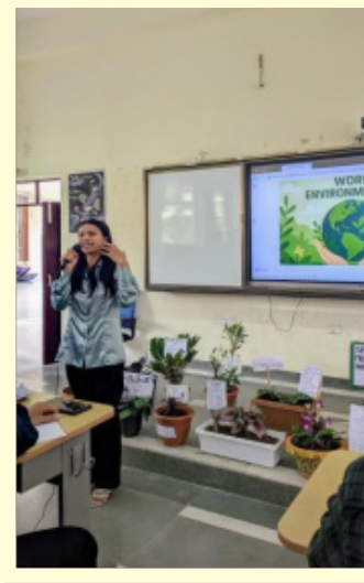
Extempore Speech in Progress