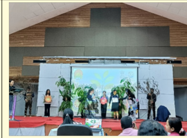
Skit Presented by MA Education, 2ndSemester