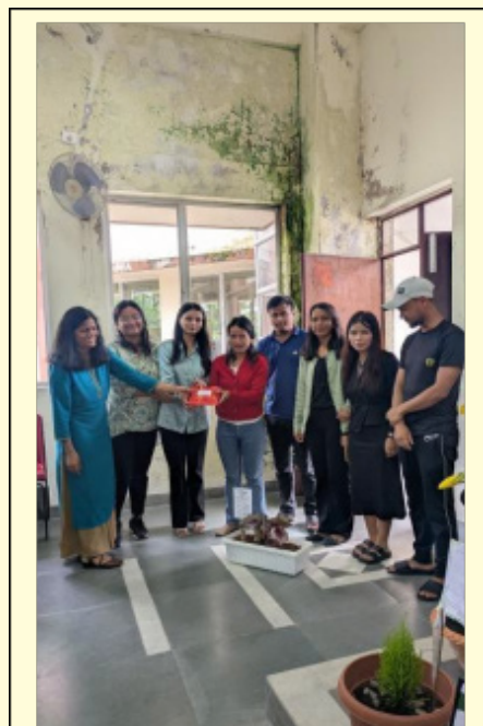
2nd Place: Group2, M.Ed 2nd Semester