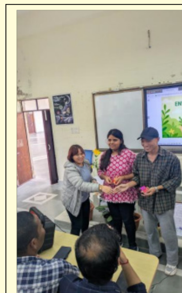
3rd Place:MA 2nd Semester