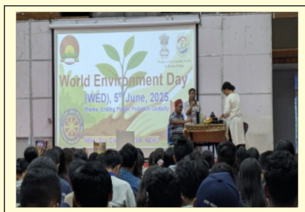
Skit Presented by MA Education, 2nd Semester

The second skit was executed by the MA 2ndSemester students on the theme “Child with a mindset of change, (plastic make our life easier. Citizen throws plastic and one child who want to change”.