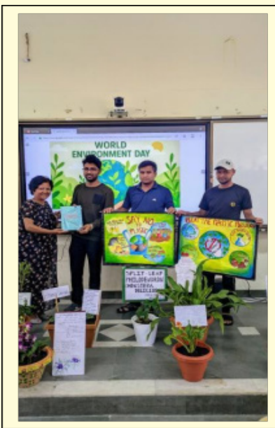
2nd Place: MEd 2nd Semester