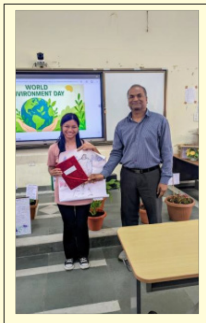
1st Place: MA 2nd Semester

Result: For the poster making, the 1st place was grabbed by MA 2nd Semester, while 2nd place was won by MEd 2nd Semester and the 3rd place was won by again MA 2nd Semester.