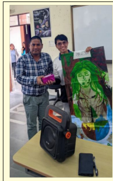
3rd Place: MA 2nd Semester