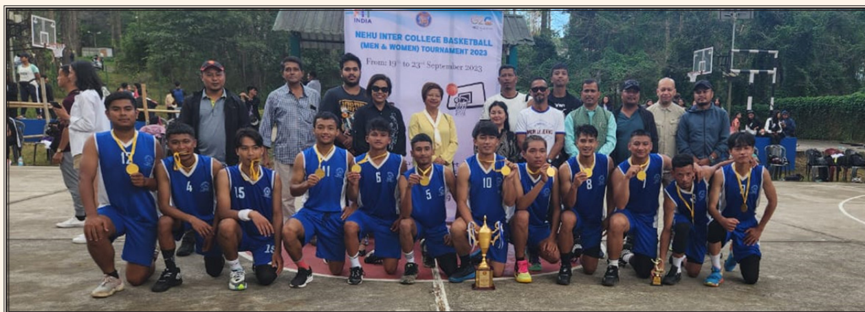
Photo of the Men Winning Team of NEHU Inter College Basketball Tournament 2023- St. Anthony's College