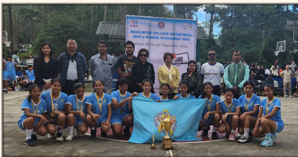
Photo of the Women's Team of NEHU Inter College Basketball Tournament 2023- Shillong College

The final matches of the tournament were played on the 23rd of September 2023. In the women, section St. Anthony's College defeated Shillong College by 38-11, and in the men's section, Shillong College defeated St. Anthony's College by 88-83.